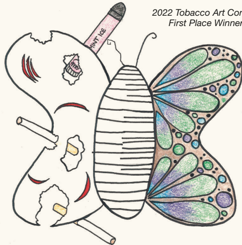
2022 Tobacco Art Contest First Place Winner